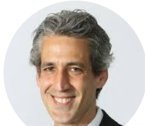
Mayor Daniel Biss City of Evanston