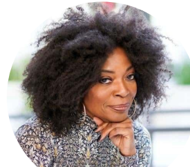
Tina Lifford Actor, Playwright