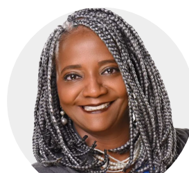
Vanessa Hall Harper Councilwoman, City of Tulsa