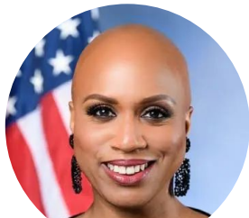
Ayanna Pressley U.S. Congresswoman